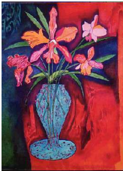
“FIORI” 1998 - 1999