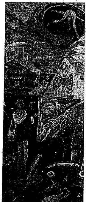
PIETRO BIANCHI, Ragnatela , 19